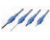
Single-Use SuperCut Needle Electrodes †