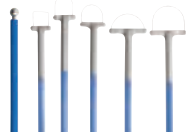
Single-Use LLETZ / LEEP Loop and Ball Electrodes †