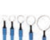
Single-Use Dermal Loops †