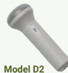
Model D2 2MHz Fetal Probe