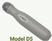
Model D5 5MHz Vascular Probe