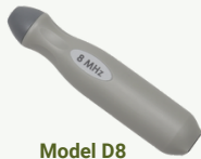
Model D8 8MHz Vascular Probe