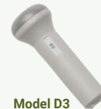
Model D3 3MHz Fetal Probe