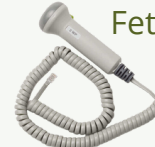
Model D2W 2MHz Waterproof Fetal Probe