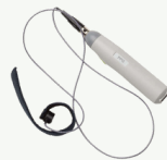
Model DPPG Audio TBI PPG Probe