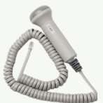
Model D3W 3MHz Waterproof Fetal Probe

Interchangeable probes can be used on any DigiDop