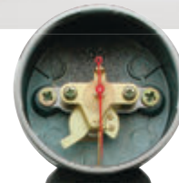
Precision-crafted, Japanese-engineered manometer movement tested to 30,000 cycles.