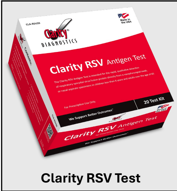
Clarity RSV Test