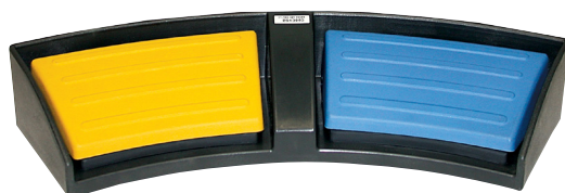
Monopolar Footswitch (BV-1253B)