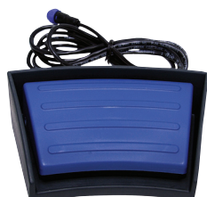
Bipolar Footswitch (BV-1254B)