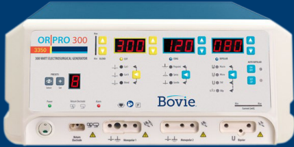
OR PRO 300 (A3350)