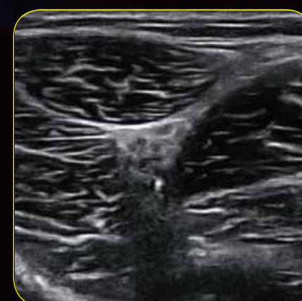
Sciatic Nerve Pop