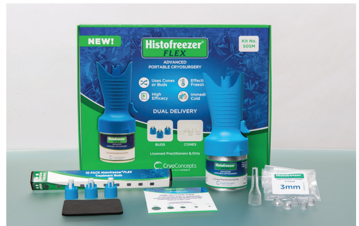
50 Count Mixed Kit (#200-5052)