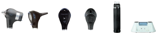
Diagnostix™ Desk Set Model Descriptions