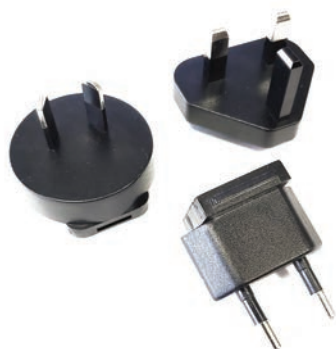
Global Adapter Kit