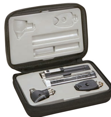
Diagnostix 5110E: Our compact, single-handle pocket set. See page 12

Diagnostix AdLED lights are warranted for life.