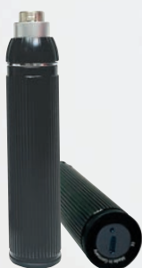
USB Rechargeable Handle Now Avail- able!