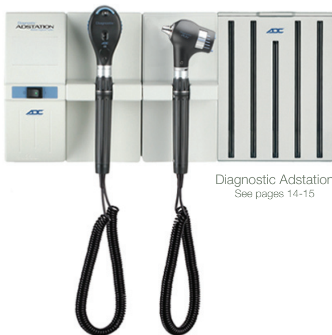
Diagnostic Adstation See pages 14-15

ADC Adstations include a universal power supply with US plug. For international use, our Global Adapter Kit (item 5660TN-GAK) can be ordered separately. The kit includes three replacement plugs for the EU, UK, and Australia that connect to our universal power supply.