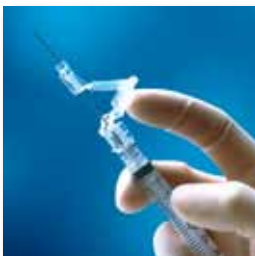
BD SafetyGlide™ Needle