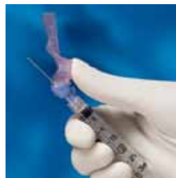
BD Eclipse™ Needle