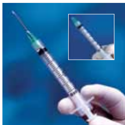
BD Integra™ Syringe